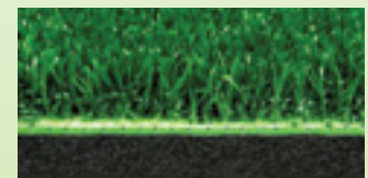
#78380 - Fairway Series Insert

These inserts are made just like our full mats, but designed to fit into this special frame. You can expect the same high performance as the full size mat. Inserts have 2 holes for rubber tees. Weight 6 lbs.