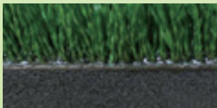
#78383 - Heavy Duty Rough Insert