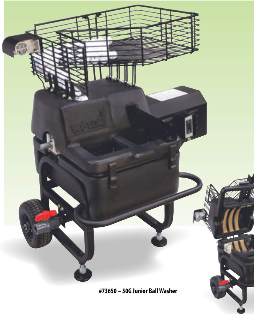
#73650 – 50G Junior Ball Washer

For the Wittek 50G Junior, our engineers took the same great design and features of our advanced 50G Superwash Ball Washer and redesigned it for the country club practice range.