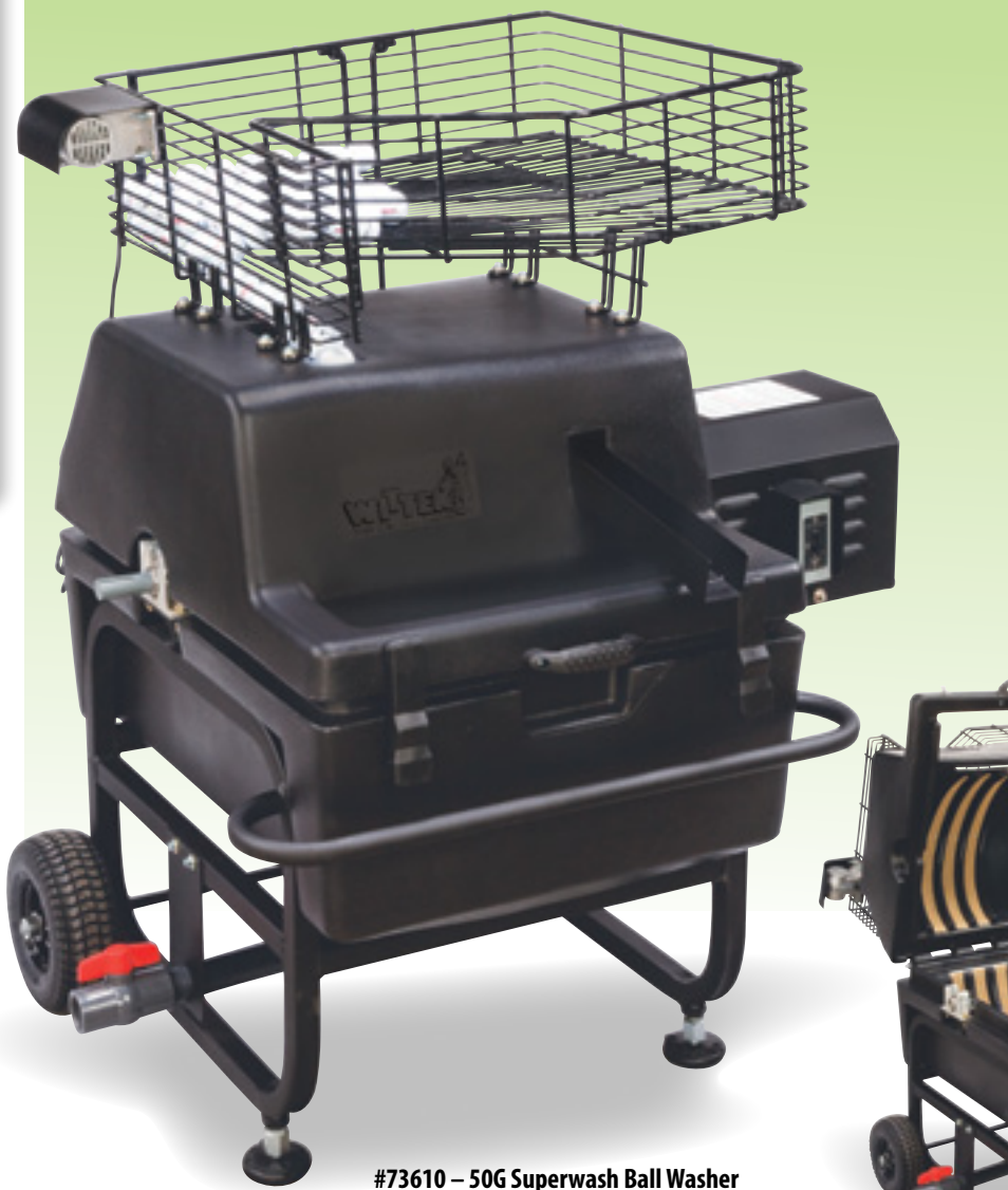
#73610 – 50G Superwash Ball Washer

The ultimate performer for heavy duty ball washing! Delivers over 20,000 sparkling clean range balls per hour to the tee line!