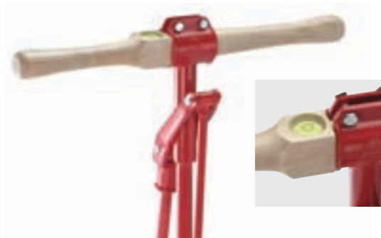
4. Hole Cutter Handle with Built-in Bubble Level